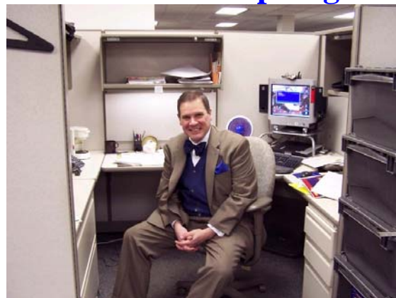
(The things you see when you don't have a gun.)